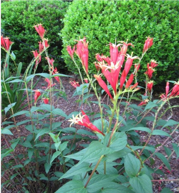
Native Indian Pink – Spigelia marilandica Serendipitous Garden – Moores Mill

PLANTS: Sense of smell Attract Pollinators-butterflies & bees Varied planter box featuring parsley Intrigue Garden