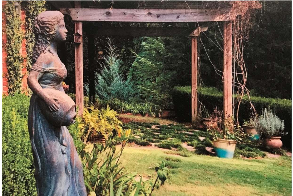
Serendipitous Garden - Auburn